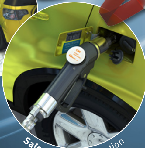
Safe and easy operation