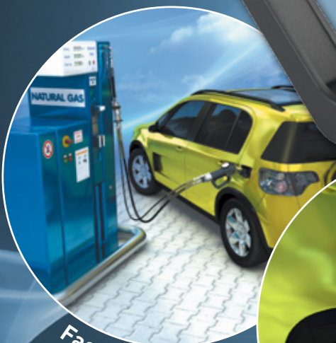
Fast filling of cars